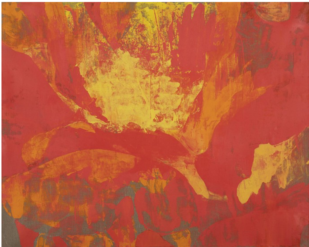
"July 18, Agua de Beber" by Eric Dever, 2016. Oil on canvas, 48 x 60 inches. Courtesy Berry Campbell.