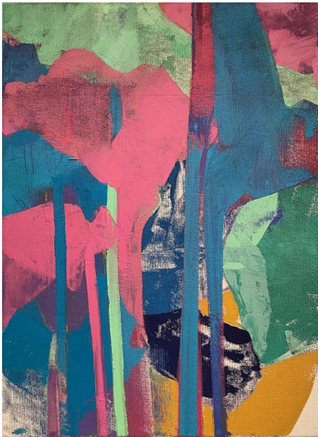
"December 6th, Le mesange" by Eric Dever, 2018. Oil on canvas, 24 x 18 inches.